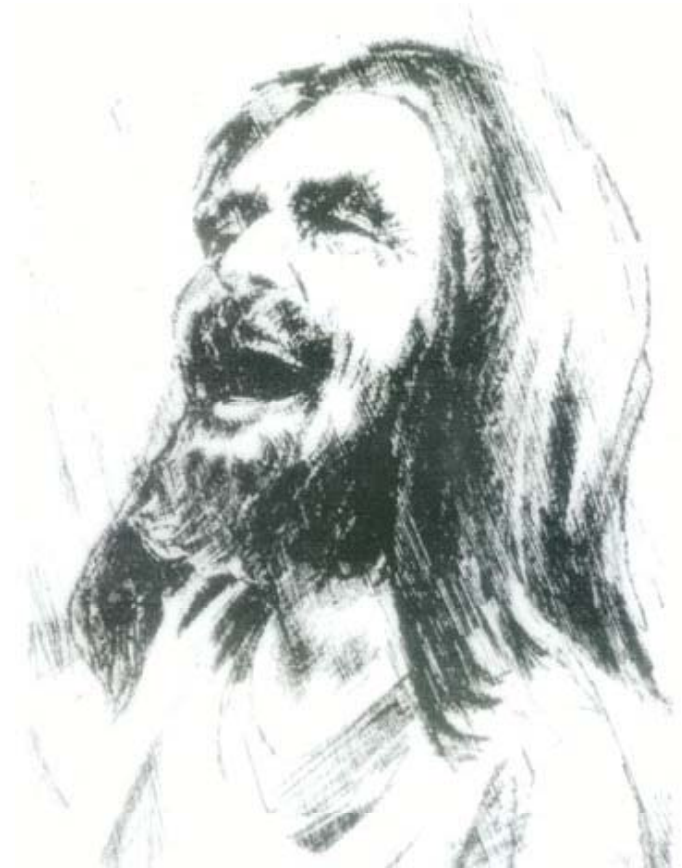
Drawing by Ralph Kovac