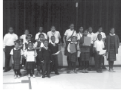
PHOTO: Writers honored at St. William of York School Writers' Tea

On November 29, St. William of York School held the first of three Writers' Teas that it will sponsor during the current school year. The event offers two writers from every class, Kindergarten – Grade 8, who have demonstrated quality and creativity in writing, to read their work before an audience comprised of fellow students, faculty and invited guests – parents, grandparents and other family members. Readings for this event included journal entries from kindergarten students, poetry from those in intermediate grades, and narratives from middle school writers. Some enhanced their work with illustrations.